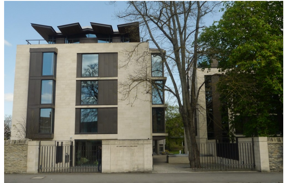
St Antony's College.

A visit to Tolkien's grave on Sunday morning where, at 11am, the Tolkien Society Chair reads from Tolkien's works and members have the opportunity to thank The Professor for bringing us together in Fellowship.