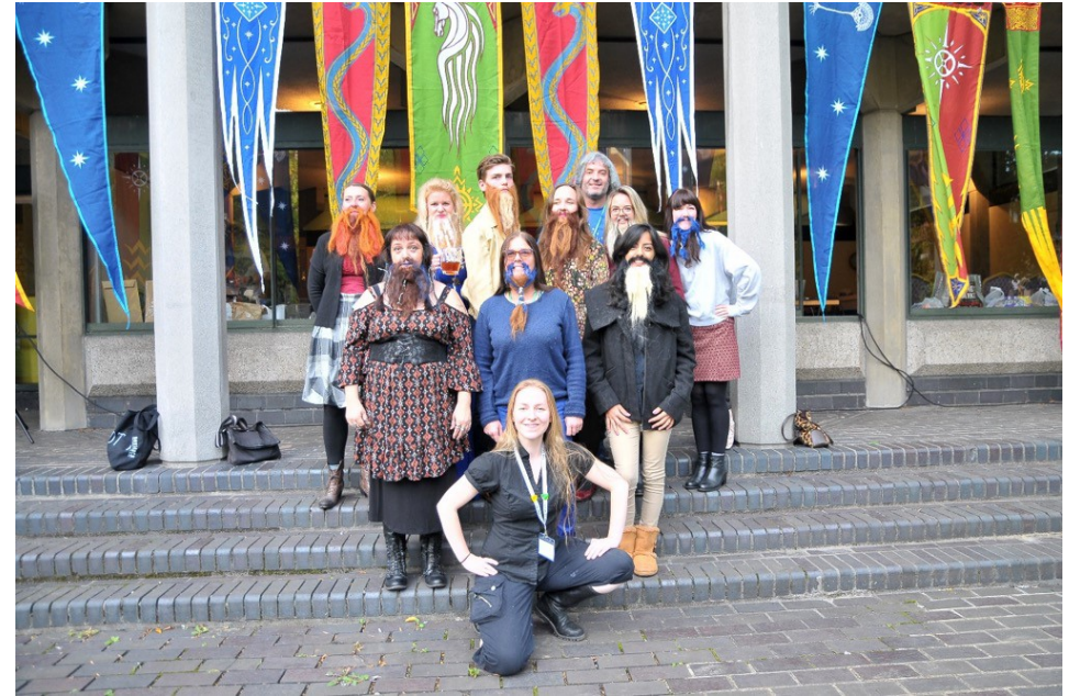
The dwarven beard-making workshop.