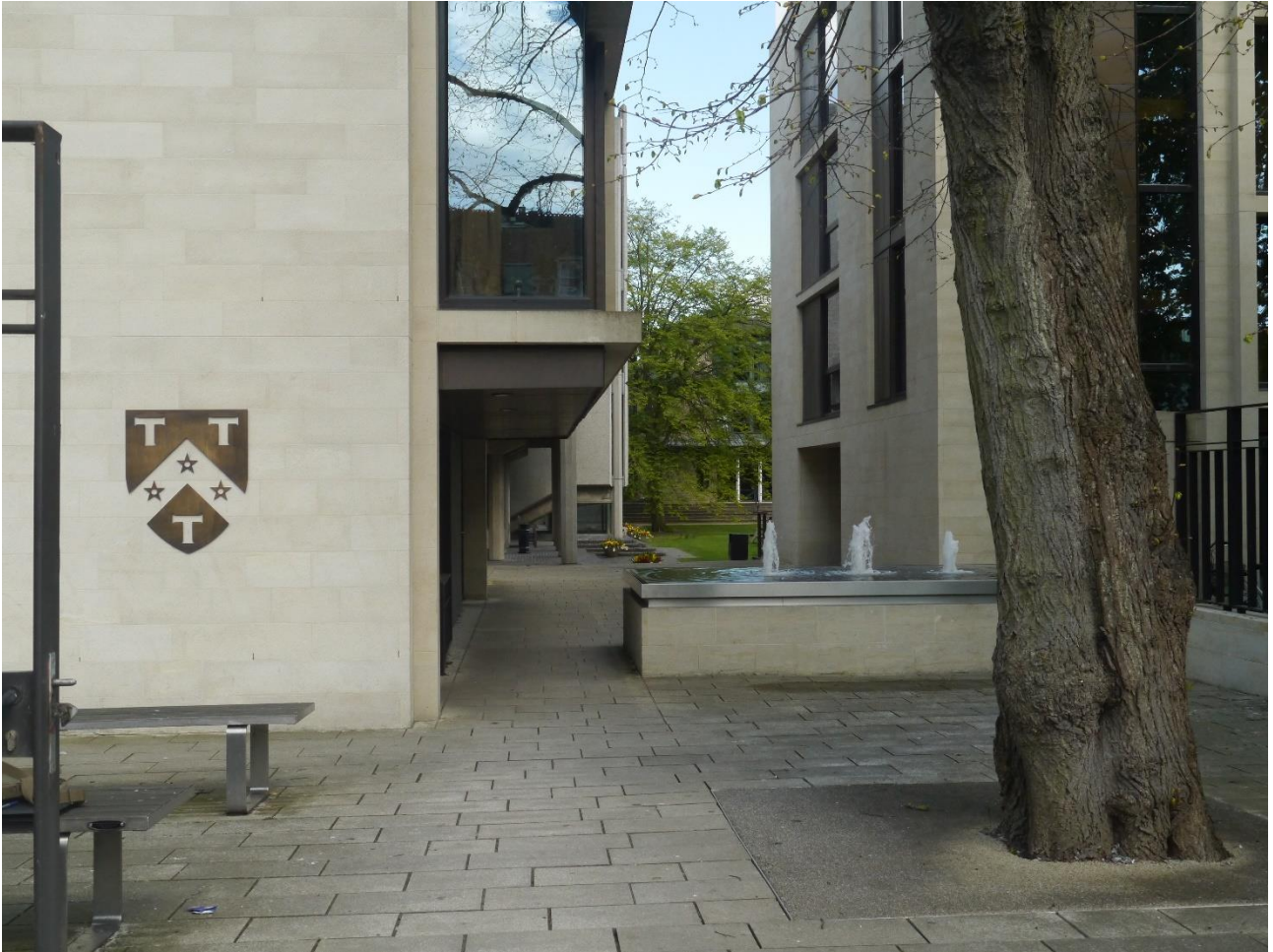
The main entrance to St Antony's College, Oxford. Porter's Lodge on left.